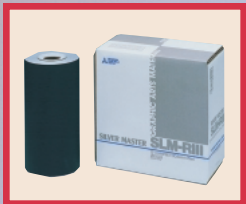
Plate Making Materials, Equipment and Processing/Printing Chemistry

Mitsubishi's SilverMaster® material is a Direct-to-Plate material for production of first-generation printing plates directly from paste-up boards. Whether you use paper-based SilverMaster® materials for shorter runs or polyester-based SilverMaster® materials for longer runs, you can expect an unparalleled level of quality and consistency.